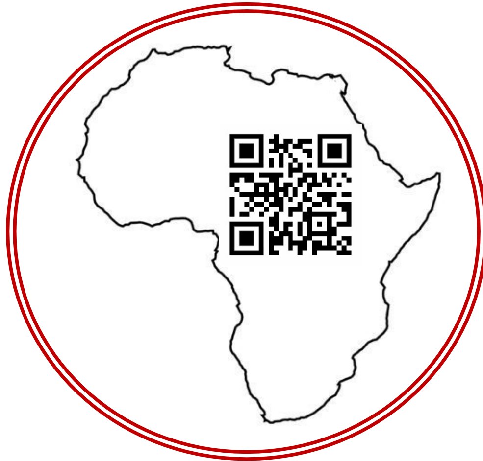
The Africa Map Circle