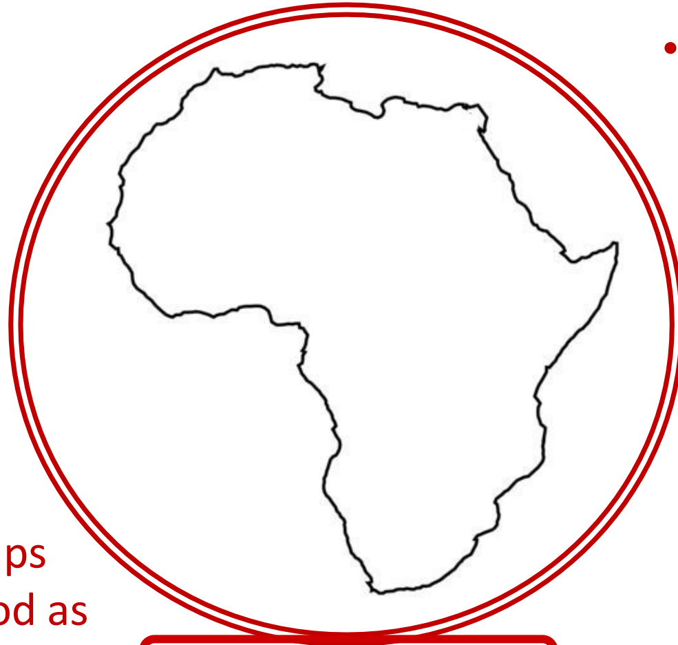
The Africa Map Circle