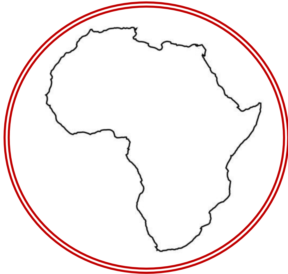
The Africa Map Circle